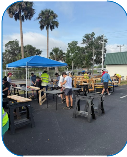
(Bed Build May 17th)